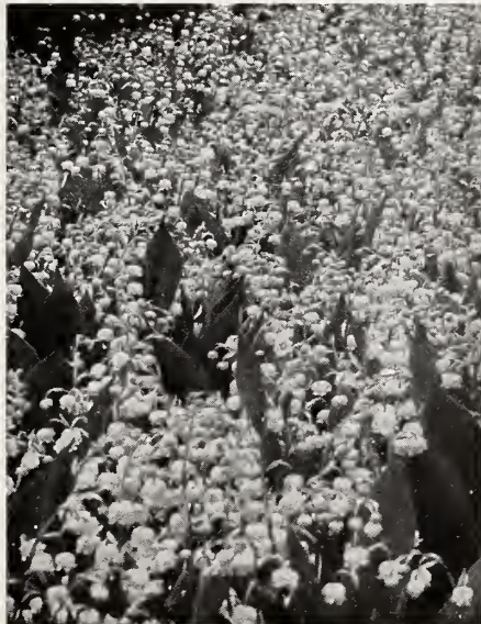
S. & W. Co.'s Lily-of-the-Valley

Our Lily-of-the-Valley Clumps are extra-selected, well grown and, if planted outdoors by the middle of April, will flower splendidly during May. If grown under the proper conditions, these clumps will increase rapidly, and every spring produce a profusion of dainty flowers. Extra-strong clumps, 50 cts. each, $5 per doz., $35 per 100.